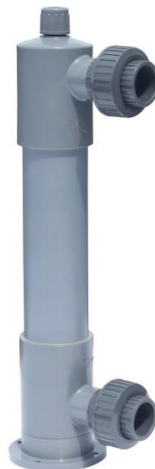
UV Disinfection Device 紫外线杀菌器-单只