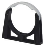
Plastic Clips 塑料夹子