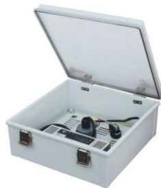
Water Proof And UV Resistant Controller Box 防水、耐紫外线电控箱